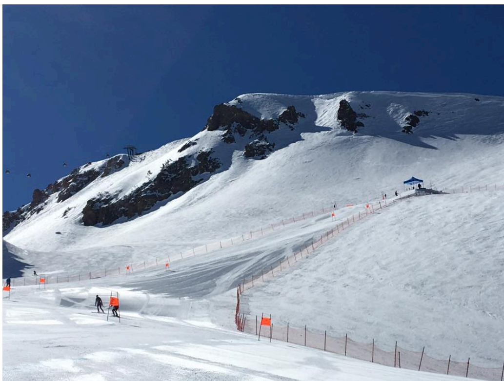
Masters Nationals DH Practice.